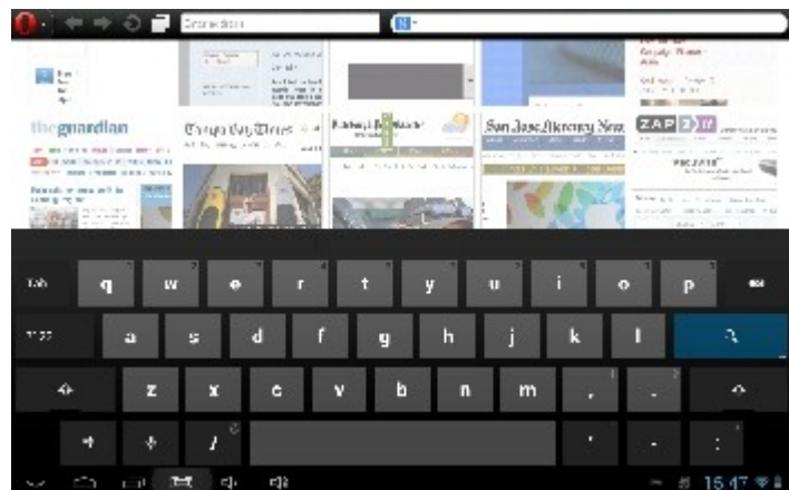
Keyboard Screen 1 (Screens 2 and 3 are symbols)

Settings-->Display-->Screenshotsetup to place screenshot button on navigation bar.