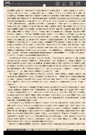
Screen Rotation (FBReader)